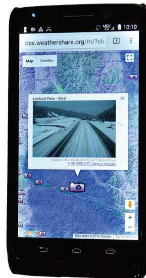
FIGURE 1 The One-Stop Shop mobile application is available on smartphones and tablets.