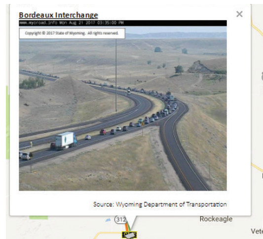
FIGURE 2 Postclosure traffic congestion, shown live on the One-Stop Shop.

From the beginning, the team has treated the One-Stop Shop as an ongoing research project and test bed. The team constantly gauges the website’s use and usability via online surveys and in-depth tracking and analytics. Team members adopted a hybrid approach that combined systems engineering and spiral development; this has enabled the rapid incorporation of changes into the system in response to feedback from surveys and usage tracking.